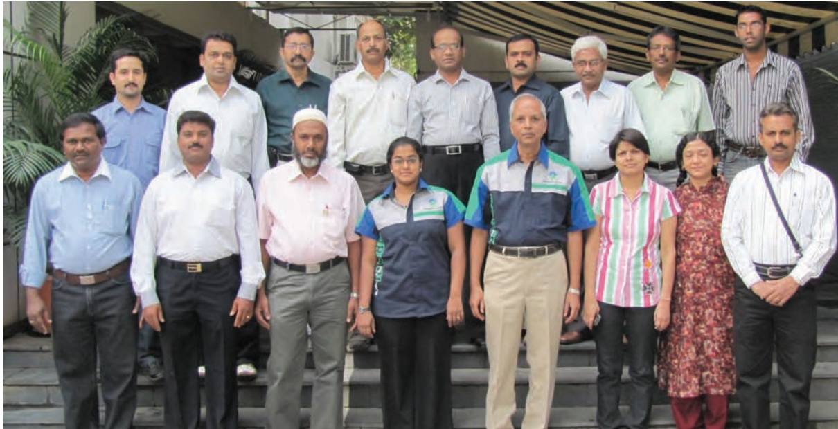
IPA and IAPMO India Conducted second Train the Trainer Workshop between March 13-16, 2010, at Pune

GreenPlumbers India training and accreditation workshops are designed to assist plumbing professionals in understanding their role in relation to Environmental & Public Health issues and to provide their customers with up-to-date information and advice on: