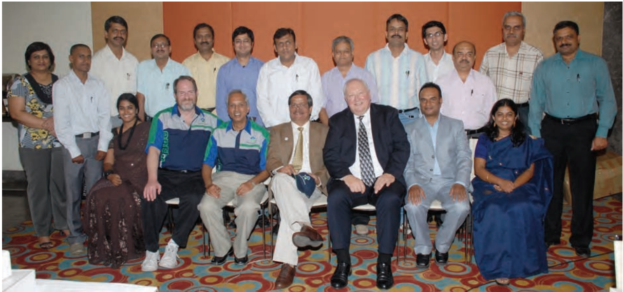
IPA and IAPMO India Conducted Train the Trainer Workshop between December 9-12, 2009, at Bengaluru.

GreenPlumbers India program was launched on February 5, 2010 during IPA conference and Plumbex'2010 at Mumbai.