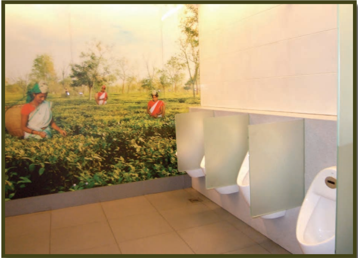
Toilet at Delhi Airport