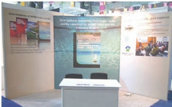
IAPMO India Stall at Plumbex 2011 at Mumbai