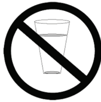
FIGURE 601 INTERNATIONAL SYMBOL

The background color and required information shall be indicated every 20 feet (6096 mm) but not less than once per room, and shall be visible from the floor level.