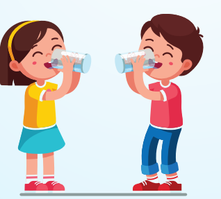
Improved water quality and public health