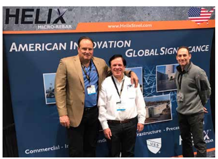
IAPMO UES Shield displayed on Helix's tradeshow booth