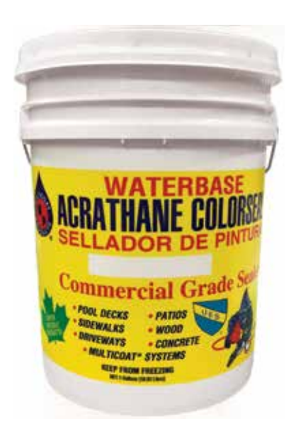
IAPMO UES Mark on Multicoat Products

IAPMO UES mark prominently placed on Ceilume batch labels on every box tiles